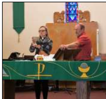
The Assisting Minister provides a lay volunteer to help the Presiding Minister in leading worship.