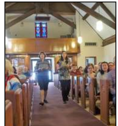
One of the duties of the Ushers is to receive the offering and bring it forward to the Altar in worship.