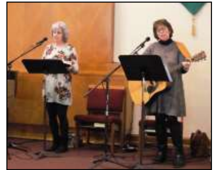
Be a Vocalist to help lead the congregation in singing or play an instrument to accompany the piano on Sundays.