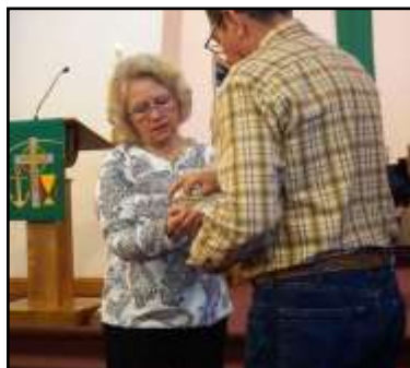
Communion Helpers assist the Pastors with distributing the sacrament of Holy Communion by serving the wine.

Picture yourself in one of these areas of our worship life by sharing your gifts of service and time.