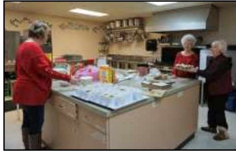
Preparing refreshments for the Trinity Connection Café on Sunday mornings.