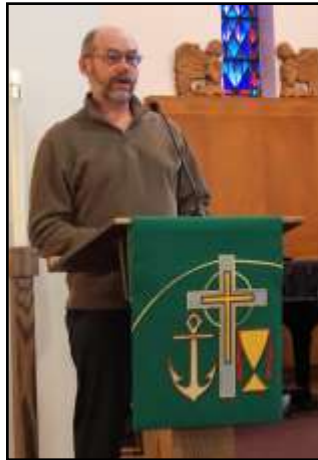
Helping with Bible readings for Worship on Sunday mornings.