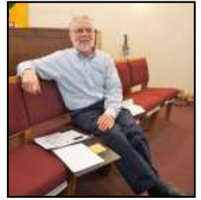
Ahh the life of a Power Point Operator!