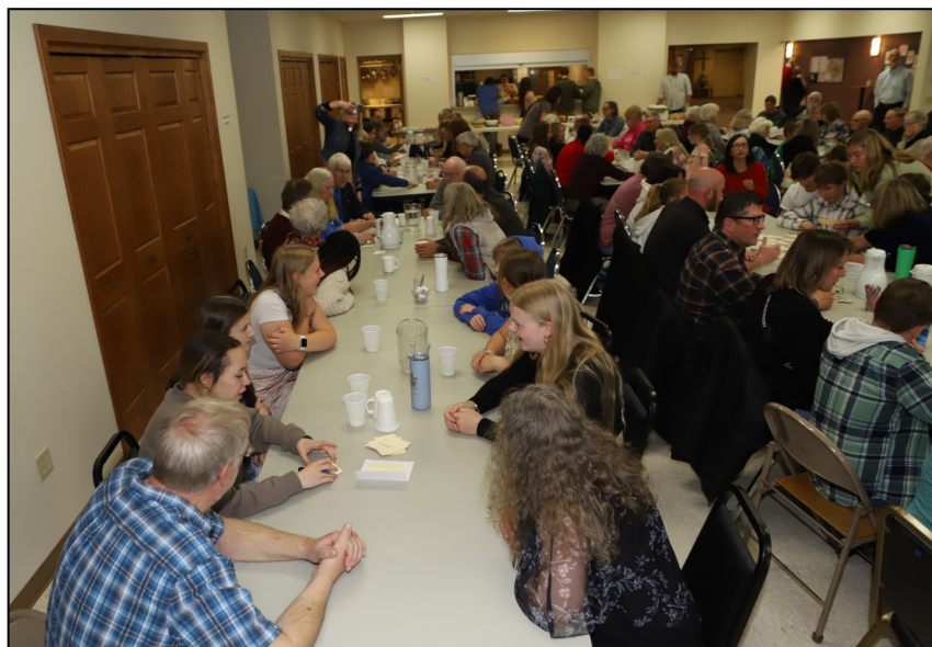
Fellowship Hall was packed with people who enjoyed a group game and a First--of-the-year picnic lunch complete with brats and hotdogs.