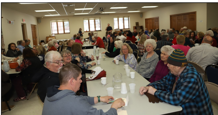
Asking the questions, "Someone who. . ." as table groups.