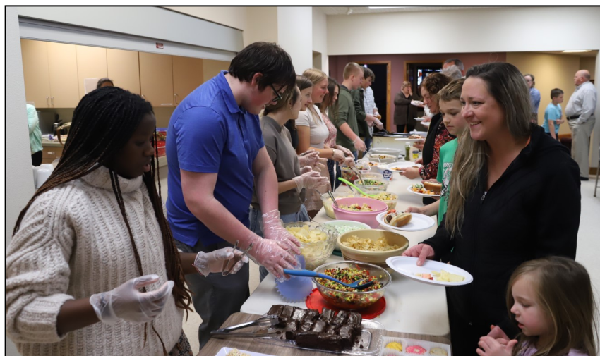
The High School youth going on the summer Flathead Lake Lutheran Camp trip to Montana were our food servers.