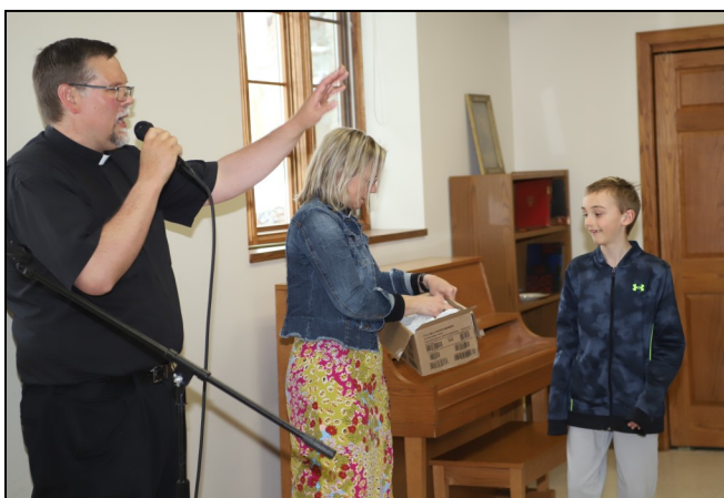
The winning table rep claimed the prizes!