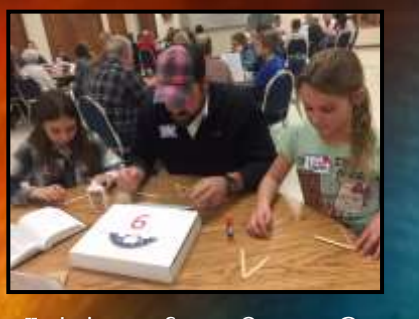
The theme for February is "Love." Join us for a Cross+Gen Event on Wednesday, February 13th. We begin with worship at 5:30 pm followed by Scripture, Skits, Music, Games, Blessings and more. The evening concludes by 7:00pm.