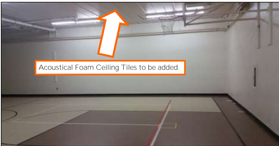
Acoustical Foam Ceiling Tiles to be added.

Making our gym usable for activities where conversation is required will potentially free up the Fellowship Hall for other uses and allow two or three large group activities to occur at the same time, making more effec-